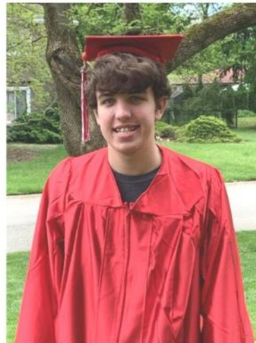
Thomas Horner High School Diploma Will be attending Purdue to study Mechanical Engineering Technology

Our prayers surround you as you begin new adventures!